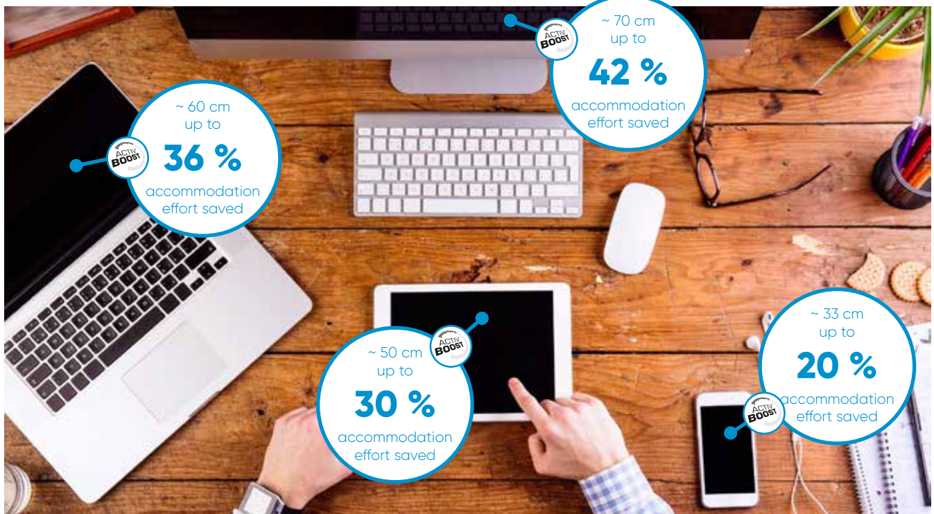
Measurements carried out for a 0.6 addition Distinctive Easywork lens. At 60 cm, the necessary accommodation is 1.67 diopters; with an addition of 0.6 diopters, the remaining accommodation effort is only 1.07 diopters

18-40 year olds can continue living the life they want to the fullest, without having to compromise.